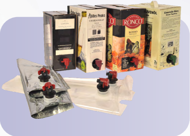
Aran's Products – BIB and fitments