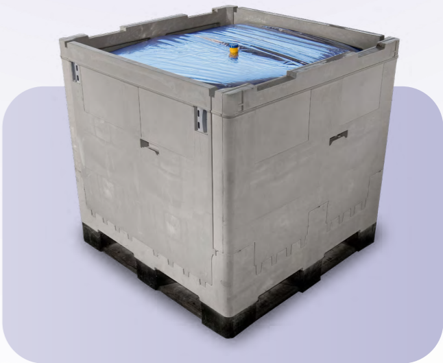
Innovative Folding Method for IBC's Pillow Liners